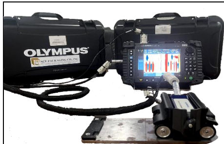
EDDY CURRENT ARRAY

ECA (eddy current array) provides the ability to detect hidden corrosion and cracks in multilayer structures.